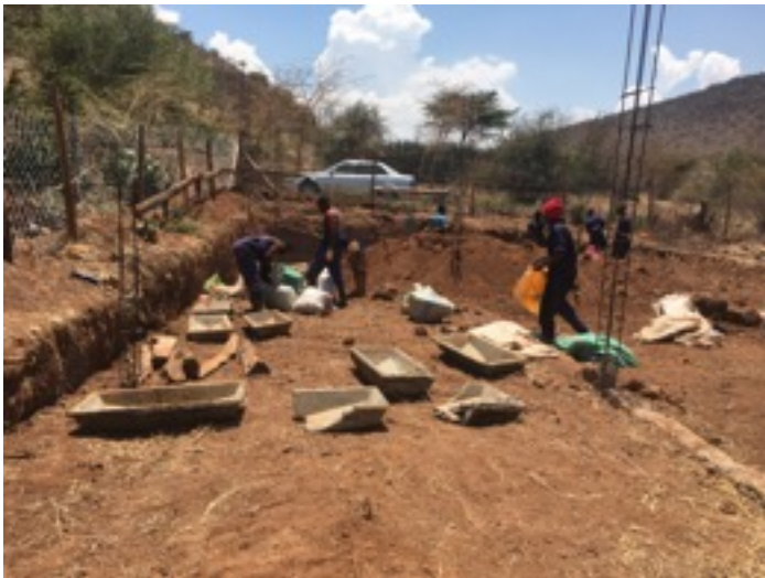
Part that needs to be completed