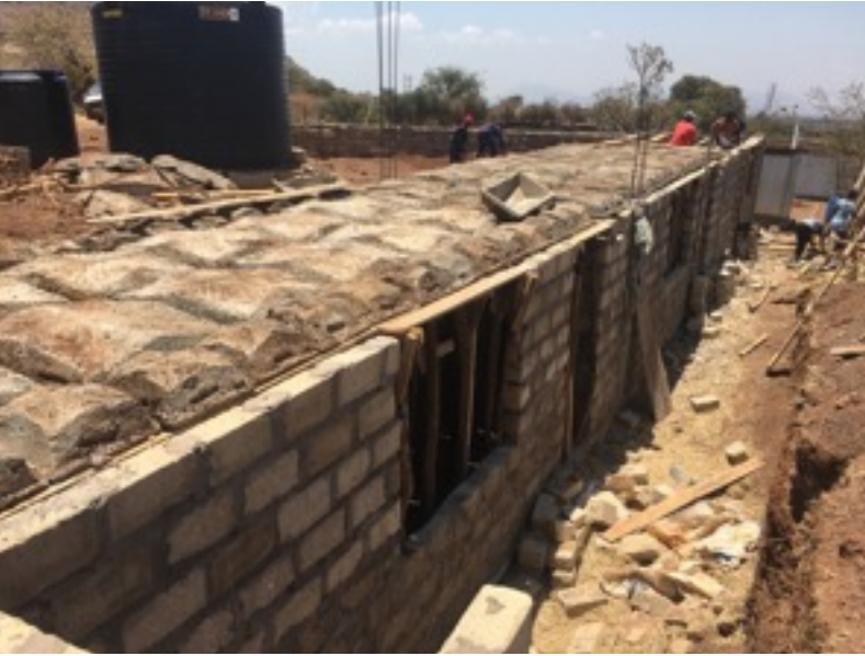
Partially completed part of the dormitory